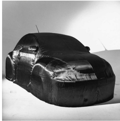
08 Helmut Newton New Beetle, Milan 1999 (Volkswagen New Beetle)