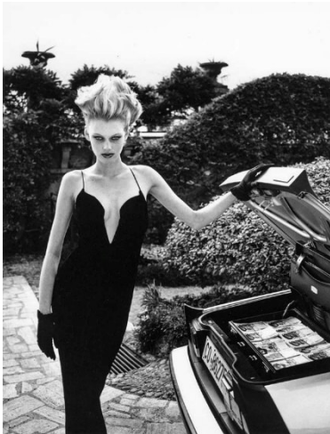
07 Helmut Newton Italian Vogue, Lake Como 1996 (Alfa Romeo Spider 2.0)