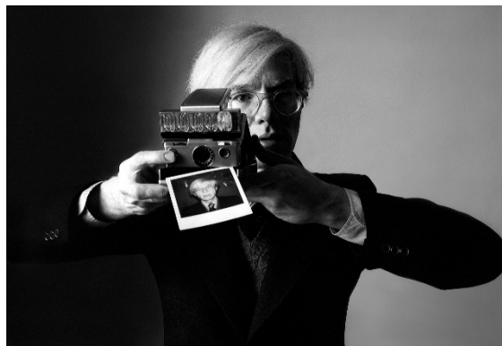
Colombo's Gallery, Oliviero Toscani, Senza Titolo 1971-1975