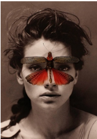
Photo & Contemporary Giovanni Gastel, Beauty, Margarita, 2012, © Giovanni Gastel, courtesy Photo & Contemporary

A focus on Gastel and the artists he collaborated with over the gallery's thirty years of activity.