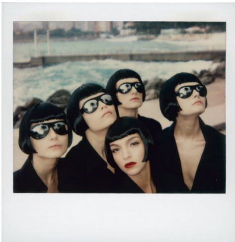
Helmut Newton, Italian Vogue , Monte Carlo 2003