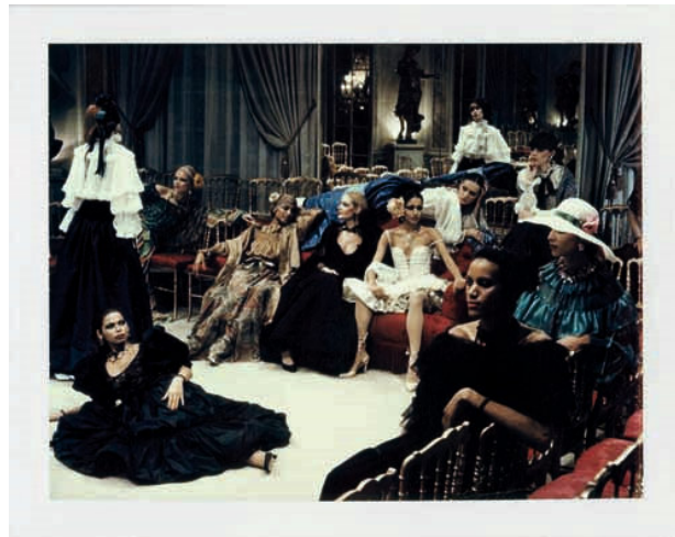
Helmut Newton, French Vogue , Yves Saint Laurent, Paris 1977

On 6 March 2025 in conjunction with EMOP Berlin 2025, the Helmut Newton Foundation in Berlin will debut Polaroids , a new group exhibition featuring works by Helmut Newton and numerous other acclaimed photographers.