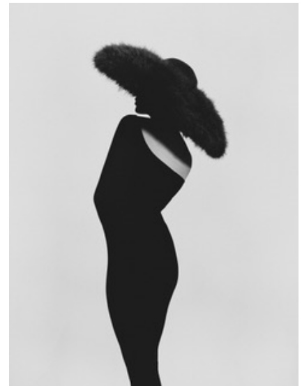
FRE, 2021 (left) | MYSTIC, 2022 (middle) | SVELTE, 2023, (right)