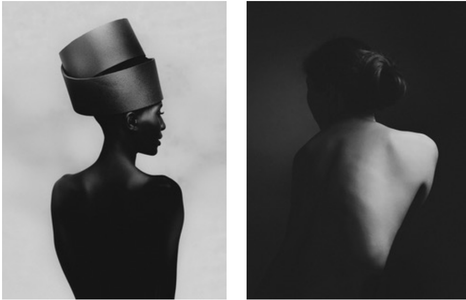
TINO VII, 2022 (left) | YAMI, 2022, (right)

He merges his photographs with the possibilities of artificial intelligence and turns this series into a mixed media project. Previously unimaginable images are created, fueled by his thoughts, experiences and the media he consumes. This fusion of elements creates a unique visual language that goes beyond traditional photography and opens a window into a world of new possibilities and discoveries.