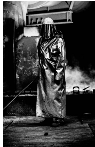
Mediterranean Sea, 2018 (left) | Steelworker at Thyssenkrupp, Duisburg, 2019 (right)

From 14 April to 25 August 2024, the Ludwig Múzeum – Museum for Contemporary Art in Budapest presents "Identity – Landscape Europe," the latest exhibition by acclaimed artist Till Brönner. Across 450 m 2 , around 60 to 70 works, including a wealth of new photographs, will be presented to the public. This solo exhibition will be complemented by a multimedia program featuring lectures, musical interventions, and panel discussions.