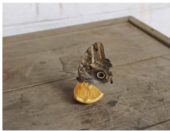
Alec Soth, Philadelphia, Pennsylvania, 2020