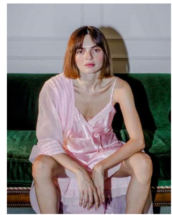
Myriam Boulos, Sexual Fantasies, 2020