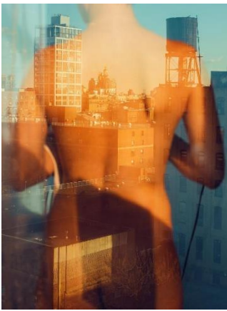
Christopher Anderson, Marion, Brooklyn, 2015