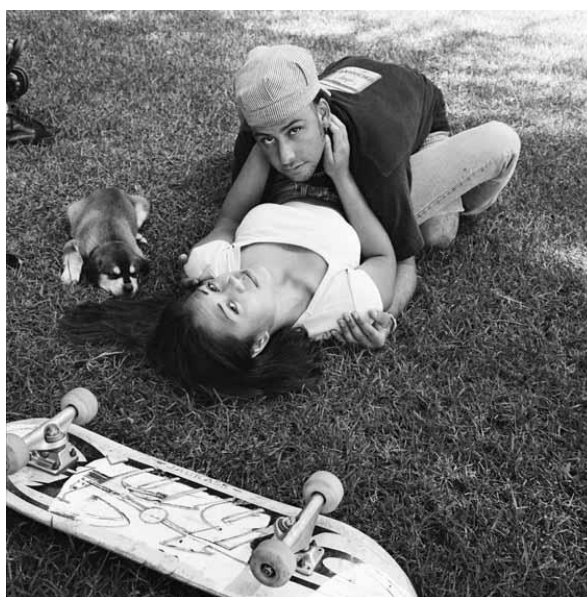
Epstein's Muffler Shop, Whittier Blvd., Montebello, 1998 (left) | Penn Park, Whittier, 1997 (right)