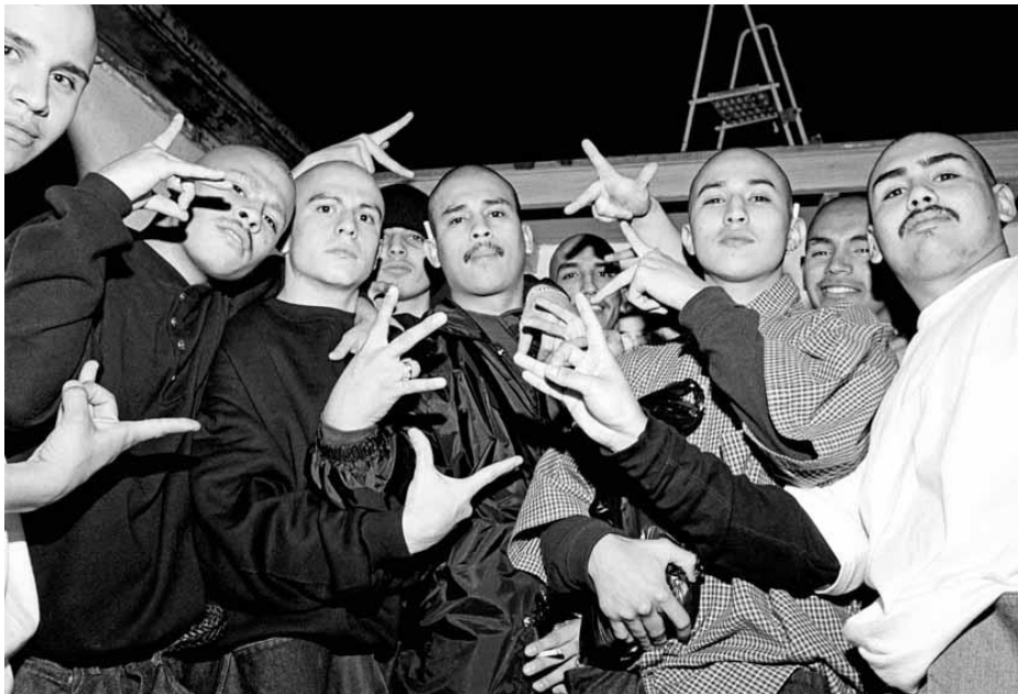
Friday Night at Monk's, Twickenham Ave, East L.A., 1997

Location: Gallery Bene Taschen, Moltkestrasse 81, 50674 Cologne