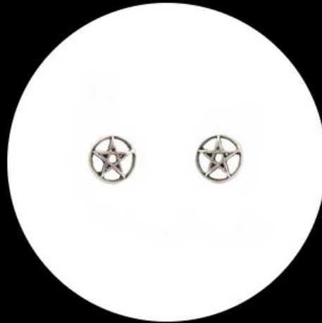
Navigator Star Stud Earrings