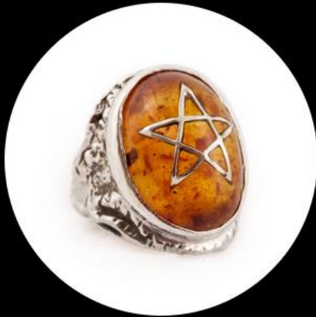
Original Amber Angel Heart Ring