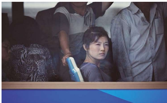
Herlinde Koelbl, Feine Leute, 1985, © Herlinde Koelbl (left) | Xiomara Bender, The Power of Dreams, Kim Il Sung Square, 2015, © Xiomara Bender (right)

Another exhibition highlight shines the spotlight on punk and its unique aesthetics. More than 50 years ago, the punk movement, with its broad repertoire of protest practices against prevailing conditions, became the catalyst of a social and cultural avant-garde. Punk did not go with the flow; on the contrary, its protagonists released their own flood of energy and ignited a fire that has not extinguished to this day. The notion of radical upheaval it embodies persists to this day, manifesting in multifaceted forms of artistic expression. Curated from the PC Neumann Collection, this dynamic group exhibition invites visitors to the Arena Club for a very special experience. The walk-in installation is enriched by a musical work composed for the show by the well-known music producer Lutz Fahrenkrog-Petersen. Typical of the era, it epitomizes the enduring, explosive power of the artistic aesthetics of punk. Punk is not dead – punk will never die.