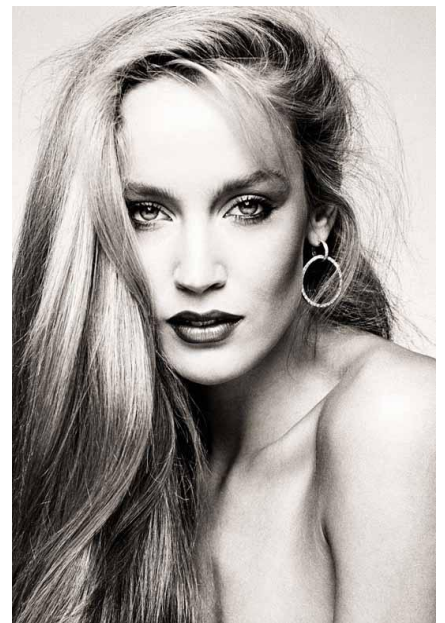
Antonio Banderas, Los Angeles, 1994 (left) / David Bowie, Los Angeles, 1987 (middle) / Jerry Hall, Los Angeles, 1975 (right)

Greg Gorman is a legend. He belongs to a very small group of iconic Hollywood photographers, who, like George Hurrell in his time, is a master of light and wields his magic to produce stunning and memorable images. During the past fifty years, Gorman has created an impressive and distinctive body of portrait photography.