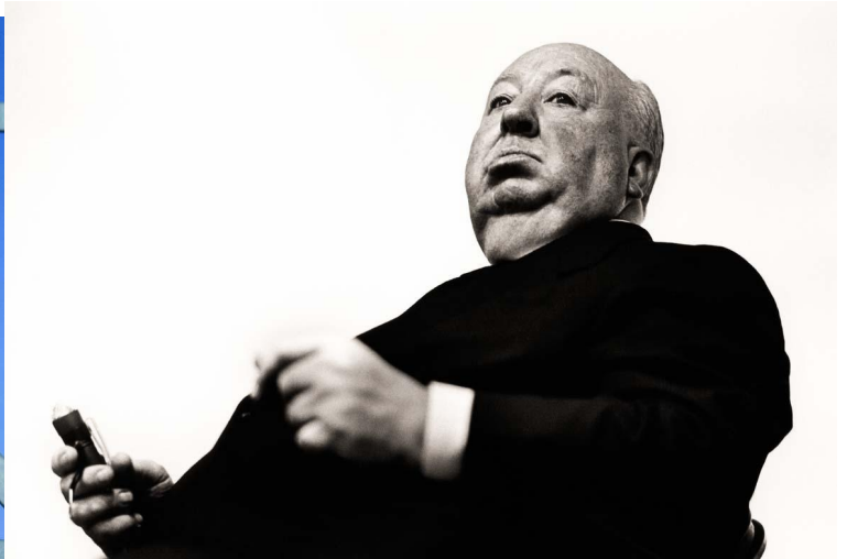
Tom Cruise, Los Angeles, 1983 // Alfred Hitchcock, Los Angeles, 1970

In his portraits, Gorman both reflects and critiques the alluring myth of Hollywood. The images, many of which were produced on assignment, are individual and formally diverse. Most of the them, however, came from personal sessions he held with the stars over the years based on their relationship. Gorman's unique photographic style fuses with his client's wishes and the impulses of his portrayed subjects in a remarkable mélange . His outstanding ability to quickly adapt to the person in front of him without reflecting his own personal ego, has enabled Gorman to become one of the most esteemed and beloved portrait photographers of our times.