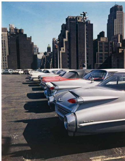
Evelyn Hofer, Car Park, New York 1965 © Estate Evelyn Hofer, courtesy Galerie m, Bochum