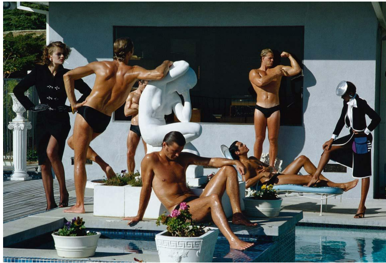
Helmut Newton, Stern, Los Angeles 1980