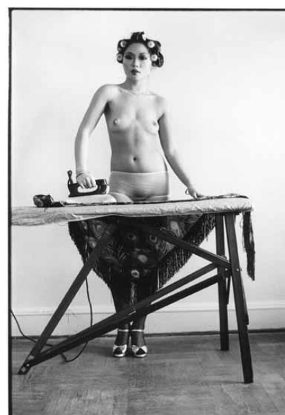
Arlene Gottfried, Hassid and Bodybuilder (left) – Butcher's Boy (center) – Eddie Sun's friend ironing (right), all photos: © + Courtesy of the artist

On September 4 th the Hardhitta Gallery will open the first solo show by American photographer Arlene Gottfried (*1960) in Germany since 1982. The exhibition will present 23 cibachrome and gelatin silver prints taken throughout the city of New York and its boroughs between 1970 and 2012.