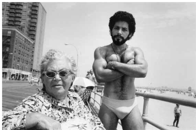
Arlene Gottfried, Dancing at Pool (left) – Angel & Woman on Brighton Beach (right)

Gottfried's photographic journal, taken over the course of four decades, is a multifaceted homage to her native New York City, its inhabitants, and the New York "state of mind" – soulful and emotionally charged, wild and crazy, nostalgic and touching.