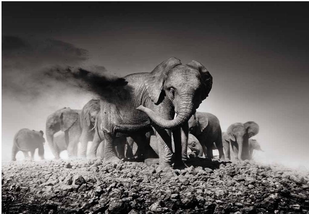
Earth I, Kenya, 2013

Location: IMMAGIS Fine Art Photography, Blütenstrasse 1, 80799 Munich