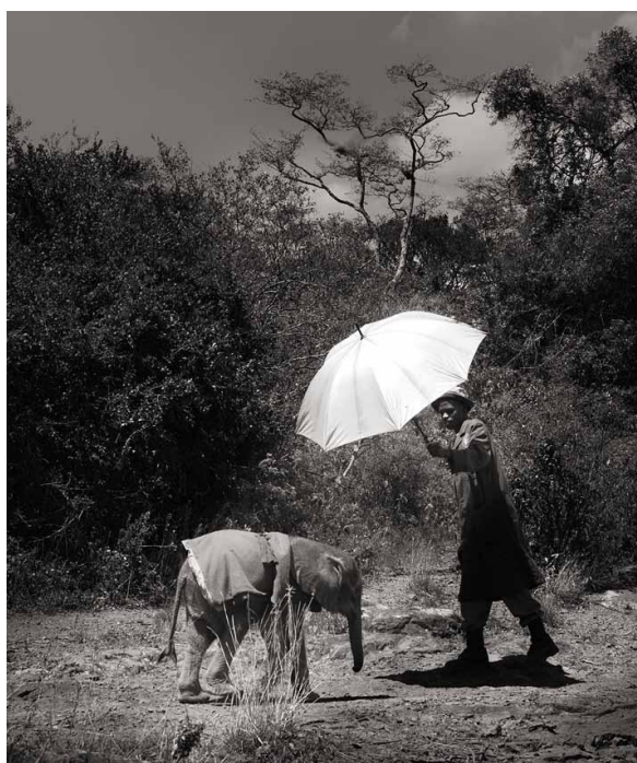
Couple 1, Kenya, 2010 (left) and Keeper with Umbrella, Kenya, 2009 (right)