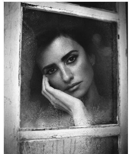
Emma Watson, London, 2015 (left) – Charlize Theron, New York I, 2008 (middle) – Penélope Cruz, Madrid, 2015 (right)