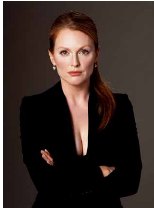
Greg Gorman, Julianne Moore, Dublin, 2004

Starting on 4 December 2015, the Helmut Newton Foundation will present “ Helmut Newton: Pages from the Glossies | Greg Gorman: Color Works ”.