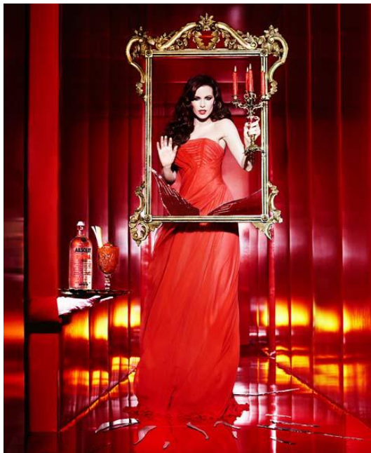
Ellen von Unwerth, From the Absolut Vodka Campaign, New York, 2009

On the one hand, the exhibition illustrates the various ways in which women are portrayed in advertising. On the other hand, it questions the reciprocal influences of fashion and commercial photography in the creation of aesthetic standards. Furthermore, the exhibition aims to reflect the sociocultural impact of marketing imagery. Advertising functions as a mirror image of social attitudes, and as such is influential in defining role models and engraining notions of beauty. In today's media-dominated world there is an ever growing tendency to disseminate more standardised values of attractiveness and beauty. Over the last decades, the use of a visual language in which female models were depicted in an objectified and provocative way led to a drastic sexualization of the public sphere. To what extent are contemporary portrayals of women still a testimony of the value society assigns to attractiveness? Is the depiction of female qualities as ideals of beauty an ineffable value, or is it an inclination in motion?