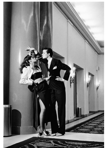
Helmut Newton, Fashion Yves Saint Laurent, French Vogue, Paris 1979

A legendary photo book, a private photo collection, and three former assistants – these are the ingredients for the new exhibition at the Helmut Newton Foundation opening on 6 June 2019 . Twenty years ago in 1999, TASCHEN published its first monumental art book: Helmut Newton's SUMO . It came out on the market in the exceptionally large format of 70 x 50 cm, with a large print run, all personally signed by the photographer, and was delivered with a metal stand designed by Philippe Starck. Later, a copy of SUMO that had been signed by numerous celebrities at a charity auction would become the most expensive book of the 20th century.