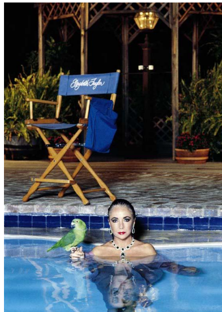
Helmut Newton, Elizabeth Taylor, Vanity Fair, Los Angeles, 1989