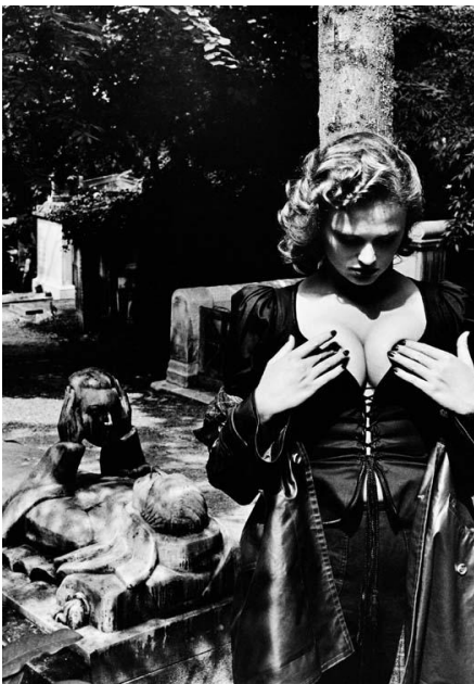
Helmut Newton, Fashion Yves Saint Laurent, Père Lachaise, Paris 1977