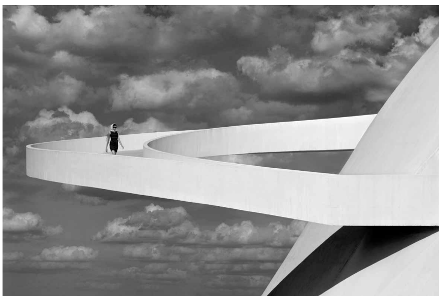
Olaf Heine, Girl Descending A Ramp, Brasilia, 2012 © Olaf Heine, courtesy the artist

After the highly acclaimed exhibition "Women on View" in spring 2019, the gallery Chaussee 36 in Berlin is back with three major exhibitions following extensive renovation and expansion – right in time for the start of the new art season.