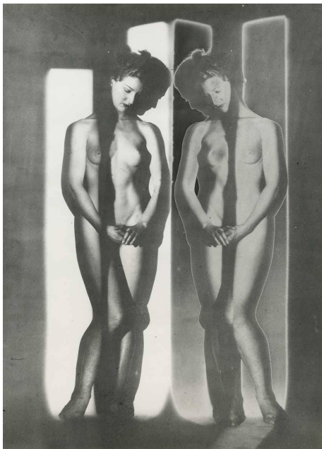
Erwin Blumenfeld, Solarized Double Mirror Cubist Nude, New York, 1945, © 2019 The Estate of Erwin Blumenfeld courtesy Howard Greenberg Gallery, NYC

Under the title ' Chasing Dreams ' Chaussee 36 presents one of Berlin's great photographers: Erwin Blumenfeld . In collaboration with the Erwin Blumenfeld Estate and the legendary Howard Greenberg Gallery in New York, around 40 of Blumenfeld's photographic studies and experimental depictions of the female body will be shown. These range from his surrealist nudes from the Paris period (1936–1941) to his graphic and illustrative works from the 1940s and 1950s, after the artist immigrated to the USA. The solo exhibition thus presents the broad artistic repertoire of Blumenfeld's vision of the female nude, while providing exquisite insight into the technical diversity of one of the great photographic icons.